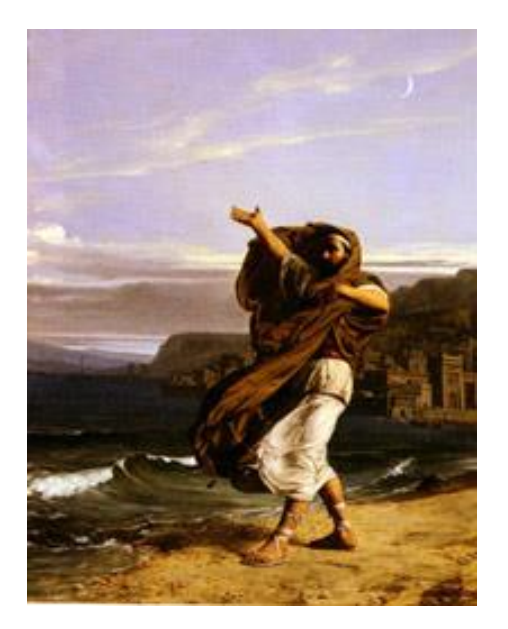
Demosthenes Practising Oratory (1870)