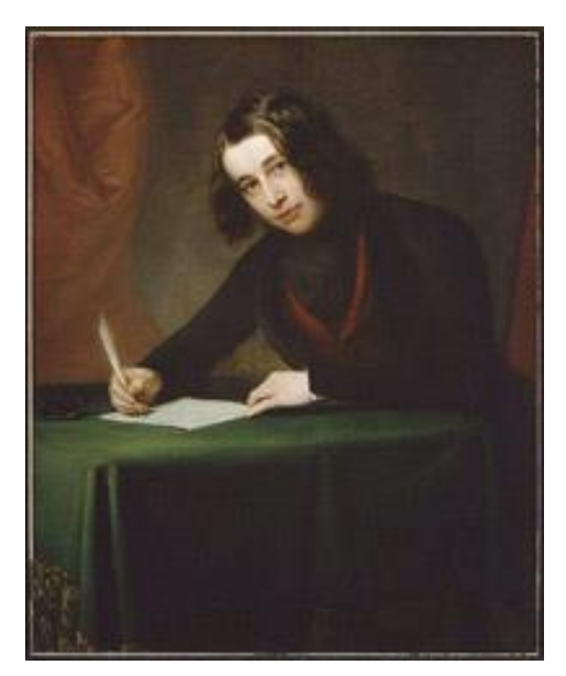
Charles Dickens (1842) Details of Term Paper

Your <u>Informal Project Statement</u>, or Project Proposal, is due by the end of Week 5, Saturday, 11 February 2023 . Basically that's a short informal summary personal statement of what you are interested in doing, how you think you might go about it, and what resources you are thinking about using. It can be as simple as the following: